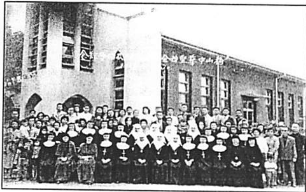
1960 Group Photo

The Sisters of Our Lady of China is a Diocesan Religious Institute of Consecrated Life, dedicated to apostolic mission work. The late Cardinal Tien, S.V.D., the first Asian born Cardinal in the history of the Catholic Church, founded the community in 1940, in Shantung Province, China.